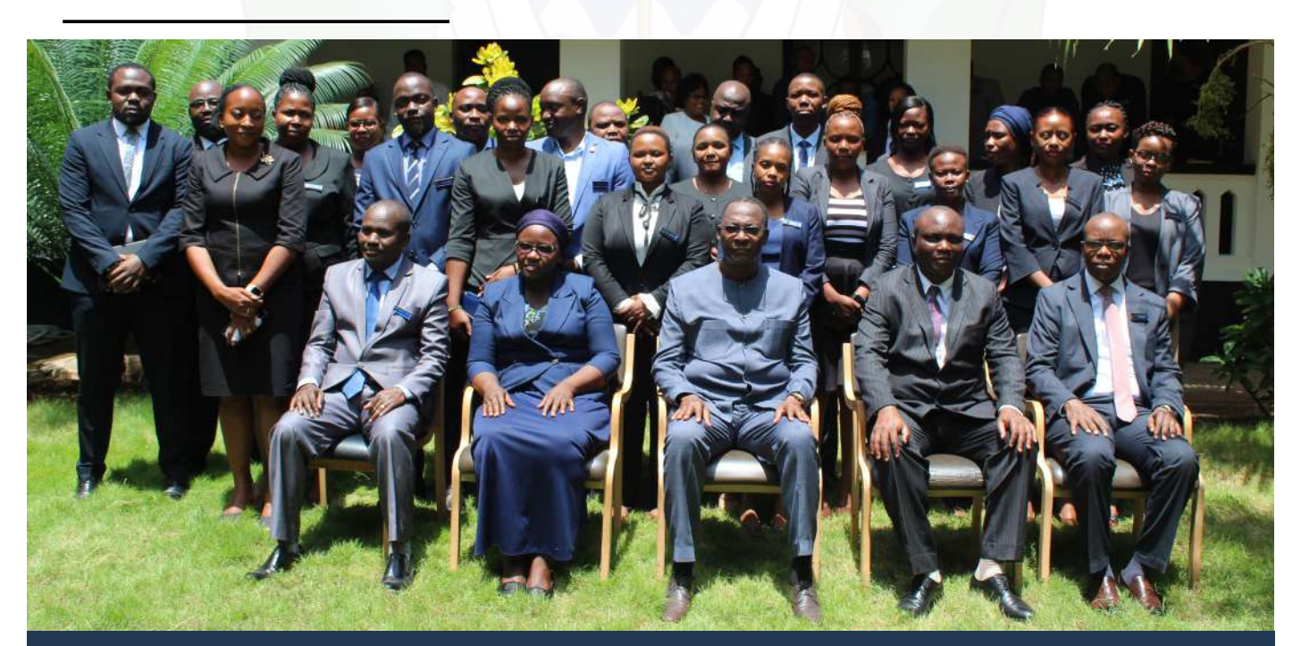
Minister of Constitutional and Legal Affairs Hon. George B. Simbachawene (middle) in a group photo with some of the staff members of the Office of the Solicitor General.

Finally, the report sets out some recommendations aiming, inter alia, to enhance the functioning of the OSG in pursuit of its vision, mission and objectives.